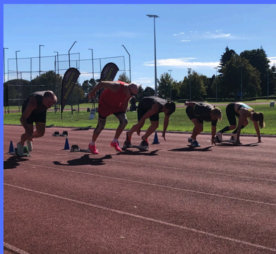
60m start... is that a break??

Thanks as always to our helpers who give up their time for the athletes to enjoy their day. Afternoon tea and that yummy food is a great finish to the day.