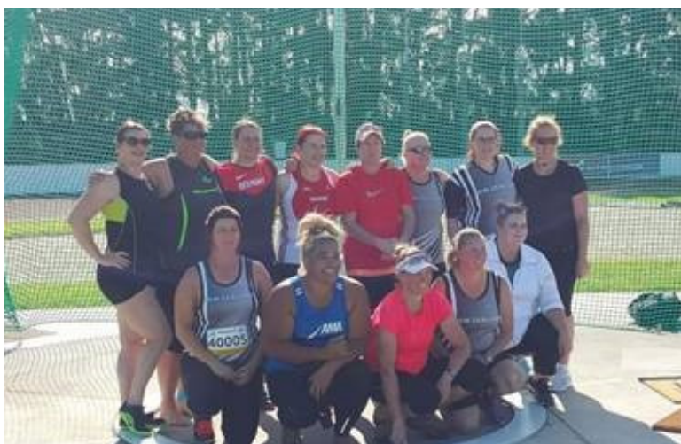
Happy group of women's Weight Throwers

Michelle had both the Discus and the Shotput. A solid outing for a pair of fifth placings. Tania's day consisted of the Discus and Javelin. A few flat no throws in the Javelin resulted in a safe 18.14m for 6th. While in a very competitive Discus, 24.18m was good enough for another sixth placing.