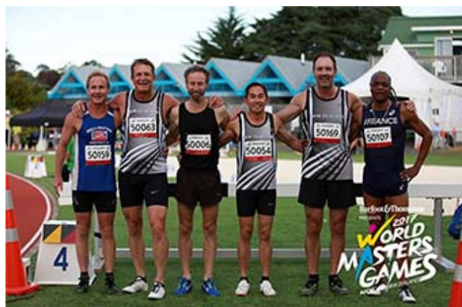
The Men's M50 400m finalists