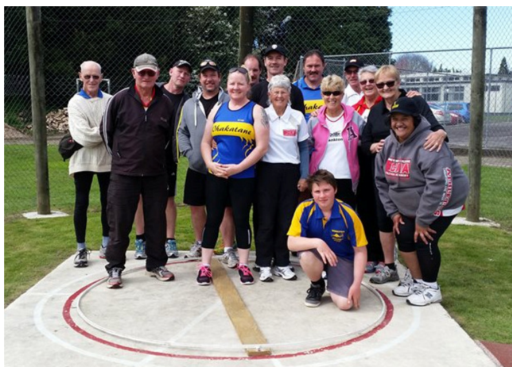
A happy group of Throwers

Our Summer track season is off to a fine start with our first track and field meeting. It was the Sunday in Labour Weekend holiday so we were unsure just how many folk would join in. We had at least 25 competitors so we were thrilled with that, great weather too. Plenty of race distances to have a try at, seven track race distances from 60m to 2000m, all hand timed and five throwing events to keep folk busy.